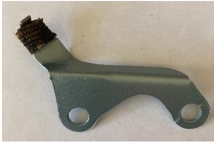
V8 OEM exhaust heat riser valve stop bracket. Attaches to the oil filter housing. $20