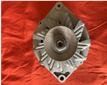
1968 GM Delco Remy 10DN alternator. Casting #1100777. 55 amp unit that has been rebuilt. $75