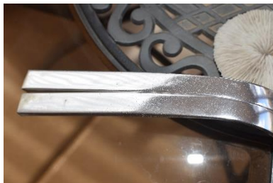
Set of headlight eyebrows for 1960 Pontiac $50.00 for the pair.

Dan O'Dell Contact info: 303-378-2746; dano6778@cox.net