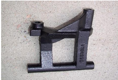
1966-68 OEM lower AC compressor bracket. 9789228. $40